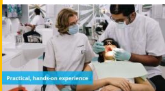
Practical, hands-on experience