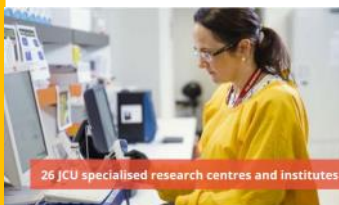
26 JCU specialised research centres and institutes

https://www.jcu.edu.au/events/2019/august/jcu-application-based-programs-webinar