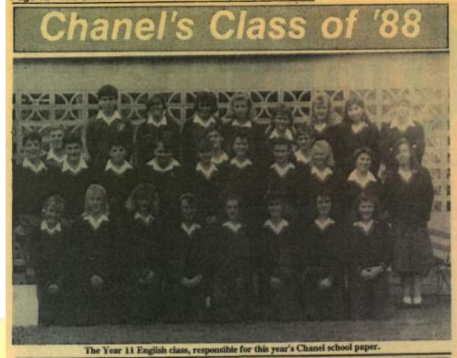
The Year 11 English class, responsible for this year's Chanel school paper.

Welcome to this year's production of the School Play by Chanel College. This is the fifth year in a row that the members of staff and senior students have combined to stage a major Play Production, and it could be said that tonight's performance is fast becoming an annual tradition.